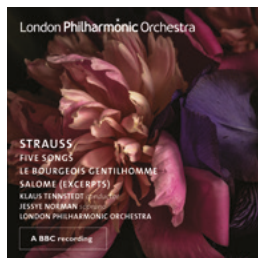
Jessye Norman sings Strauss: Five Songs & Salome LPO-0122

'Perfectly paced' BBC Radio 3 Record Review, Record of the Week, December 2021