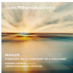
Jurowski conducts Mahler Symphony No. 8 LPO-0121

Explore the full catalogue at lpo.org.uk/recordings