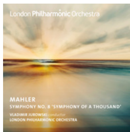
Jurowski conducts Mahler Symphony No. 8 LPO-0121

Explore the full catalogue at lpo.org.uk/recordings