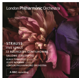
Jessye Norman sings Strauss: Five Songs & Salome LPO-0122

'Perfectly paced' BBC Radio 3 Record Review, Record of the Week, December 2021