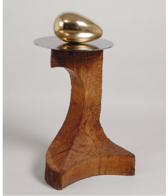
Le Commencement du monde , 1924