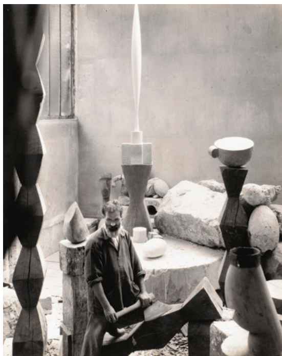
Brâncuși in his studio, 1927