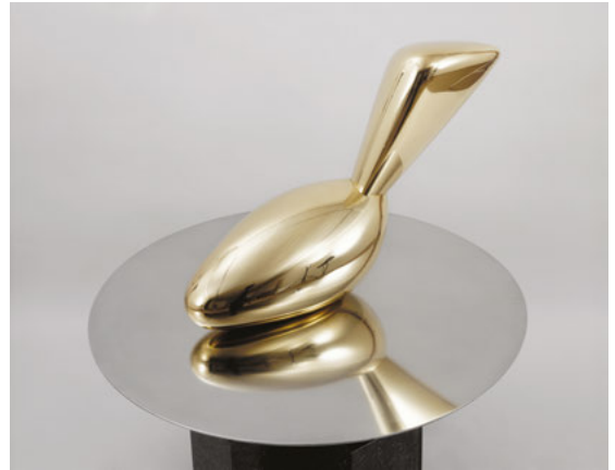
Léda , 1926