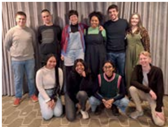
POETS AND COMPOSERS AT THE SOUTHBANK CENTRE, JANUARY 2025